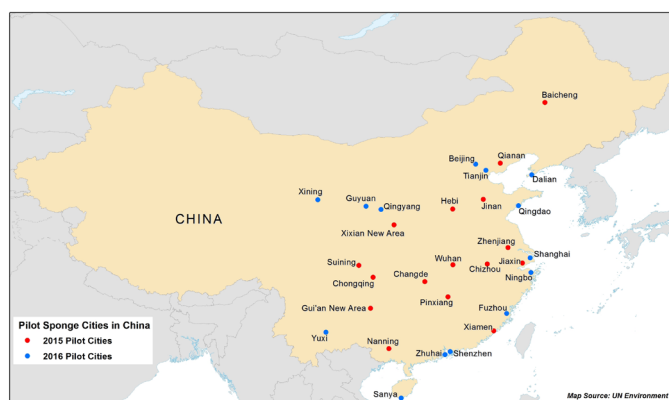
Figure 3. Location of pilot sponge cities

By 2020, 20% of cities in China should have modern drainage systems and infrastructures that allow for efficient infiltration of rainwater, with the number rising to 80% by 2030.