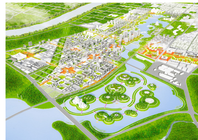
Model of a sponge city in China, Yangming Archipelago, Changde

The development pattern seeks to realize natural accumulation, infiltration and purification through urban planning, construction management, and adsorption infiltration effect of rainwater (GOSC, 2015).