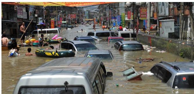
Floods in cities across China in 2016 caused as much as US$45 billion worth of damage.

As global populations converge steadily into cities (UN, 2017), fast growing cities are suffering with intensified hydroclimatic hazards. In China, more cities are facing challenges associated with urban sustainability and urban water issues such as aging/outdated water and wastewater infrastructures, urban flooding and a high frequency of extreme weather (Li et al., 2017; Lv and Zhao, 2013). Among these, urban flooding is one of the most frequent and hazardous disasters that can cause enormous impacts on the economy, environment, city infrastructure and human society (Li et al., 2017). The emerging concept and construction of “sponge cities” is an effective approach to solving urban rainstorms (Liu et al., 2015; Xia et al., 2017) and seeks to enhance cities capacity on flood prevention. (Liu et al., 2017). The concept is green, natural and sustainable. It emphasizes the principle of ecological priority which is necessary to realize a win-win situation for urbanization and environmental protection. A sponge city refers to sustainable urban development including flood control, water conservation, water quality improvement and natural ecosystem protection. (Liu et al., 2017).